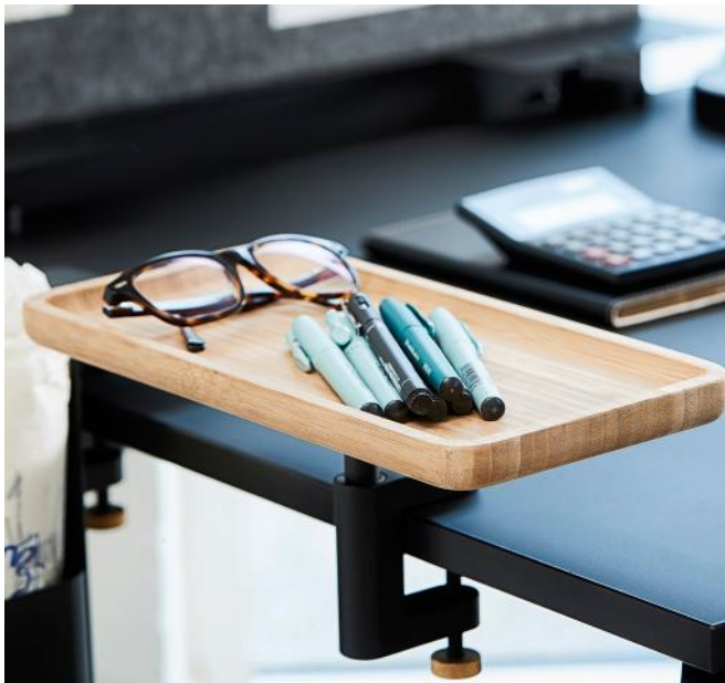
TABLE SHELF BAMBOO